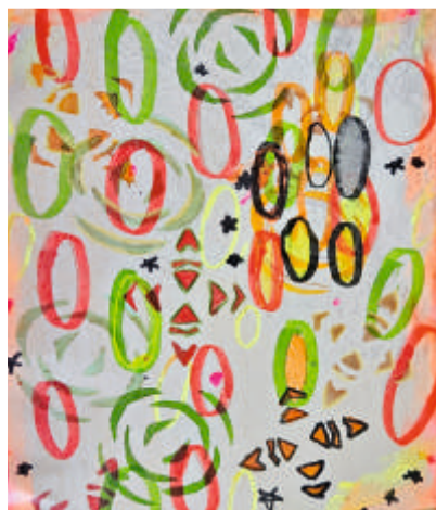
Navya Shukla Grade: III A