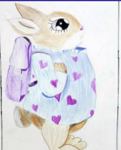
Ruhi Toshniwal Grade: III B